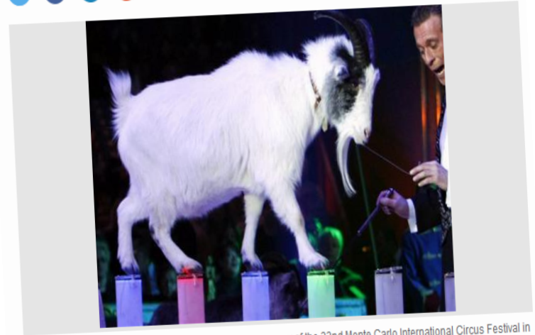
A magician performs with a goat during the opening ceremony of the 33rd Monte Carlo International Circus Festival in Monaco January 15, 2009.

Police in Nigeria are holding a goat on suspicion of attempted armed robbery.