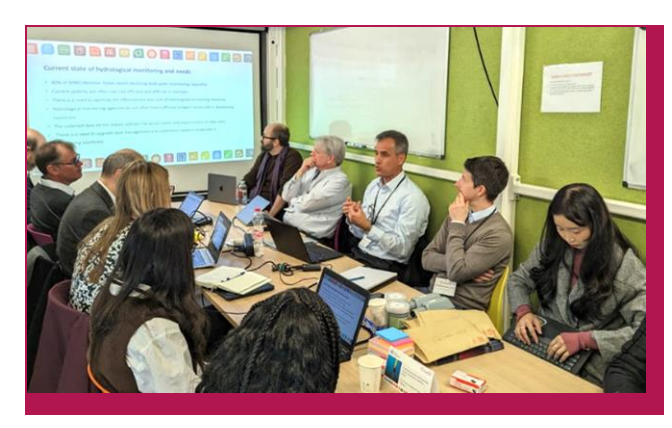
Trialogue table led by the World Meteorological Organization (WMO) about innovative youth education for water resources, at CERN IdeaSquare in 2023.

The Geneva Trialogue brings together thought leaders from Academia, International Organizations and the Private Sector to shape actionable challenges that advance the cause of education for the SDGs. This year's theme of enhancing education with artificial intelligence has a focuses on applications of AI to the Model United Nations (MUN), a global youth network which trains nearly a million young people each year in how to organize debates on the most challenging issues of our times, modelled on how the UN debates such issues.