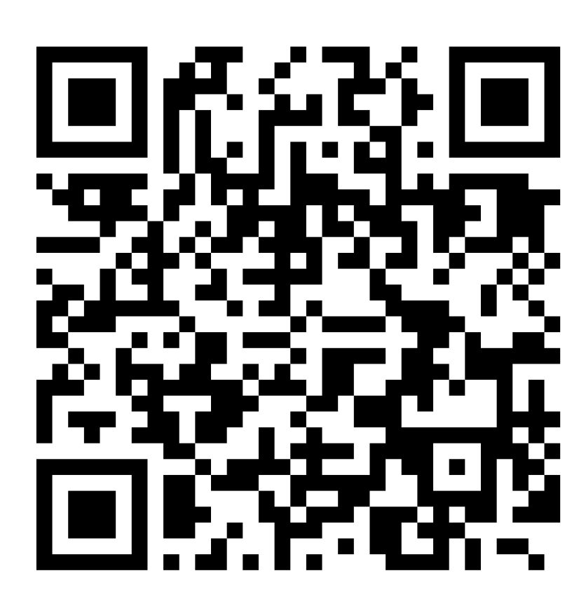
Apply to participate using this QR code or at: mymun.com/conferences/ remodel-un-2025